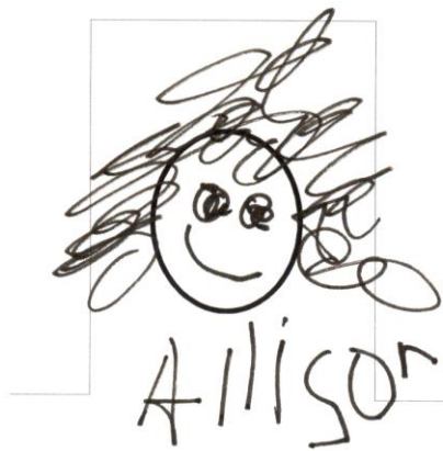
Drawing is outside template